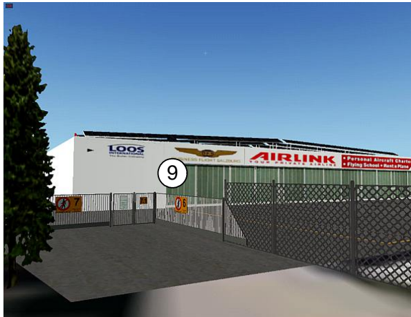
Entrance to the GAC area

The entrance gates of the airport are also animated and can be operated via the "HangarOPS" addon (Keycode = 9 for all Gates):