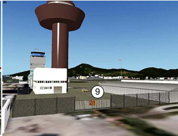
Entrance at the new Tower