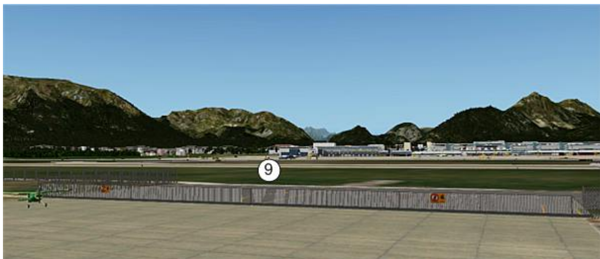
Hangar 7 and 8